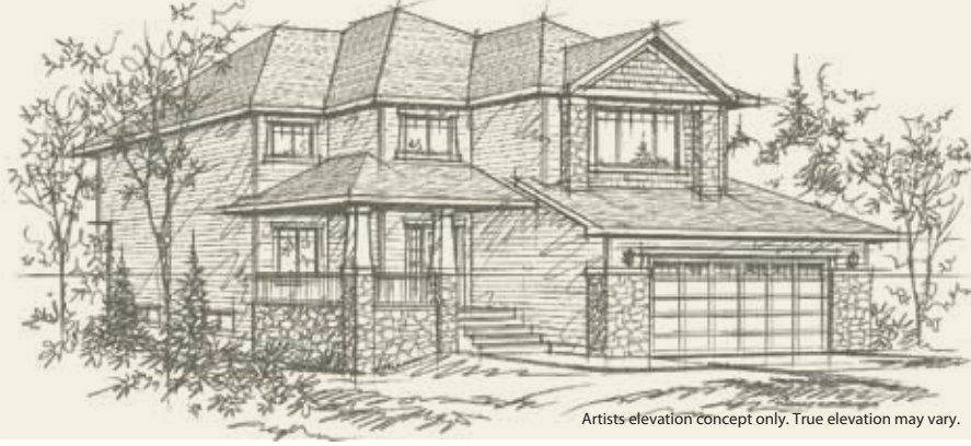
Artists elevation concept only. True elevation may vary.