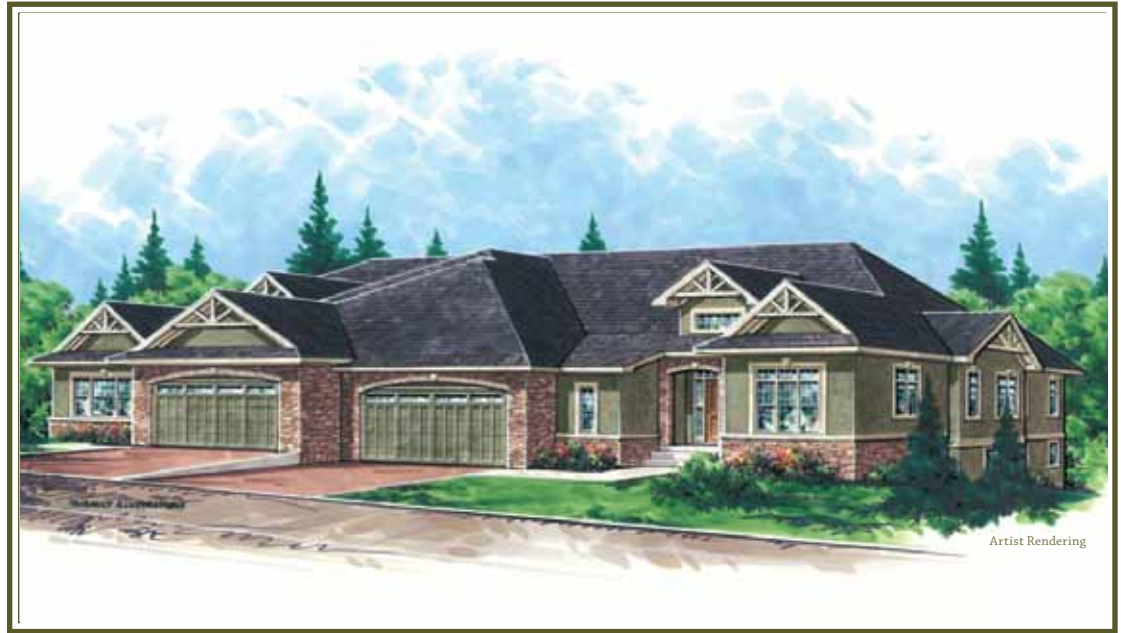
Model C / C-1